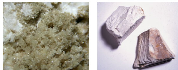
Figure 1: Left: Boehmite and Natrolite from Sagåsen (Strandåsen), Mørje, Porsgrunn, Telemark, Norway [2] (Field of view 10 mm); Right: Kaolinite [3].

To begin with, we employ molecular dynamics (MD) simulations as implemented in MedeA LAMMPS to relax atomic positions and cell parameters of bulk clay minerals and clay pores. To do so, we run subsequent NVT and NPT ensembles calculations of a duration of 100-200 ps for each ensemble.