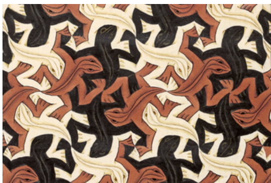
Figure 1: M.C. Escher, Lizard, 1942

The unique characteristic, which distinguishes crystals from all other forms of matter, is discrete translational symmetry. This became obvious from the early x-ray diffraction studies, which revealed that most materials form almost perfect periodic arrays at low temperatures 2,3 . Of course, crys-